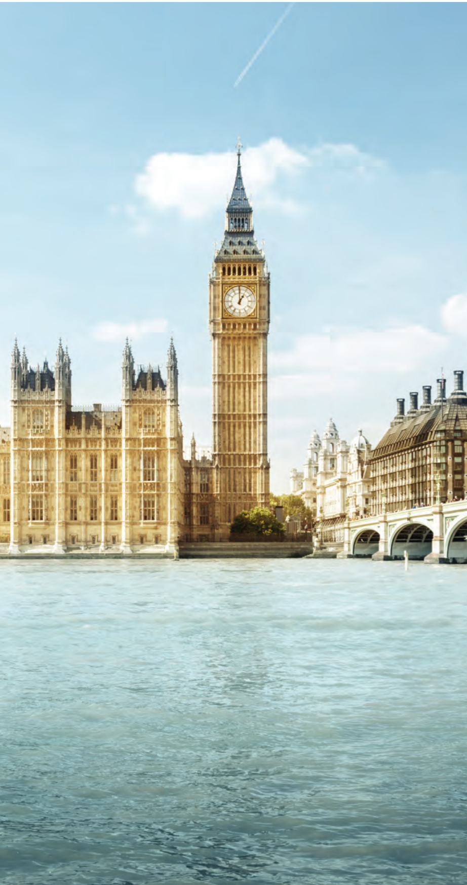
Palace of Westminster London, UK