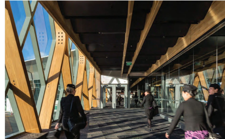
Above Domestic Terminal Extension

When it opens, the multi-level car park and transport hub will provide a technologically advanced facility, with electronic wayfinding and electric vehicle charging points being added to existing features such as exit arms opening automatically thanks to licence plate recognition.