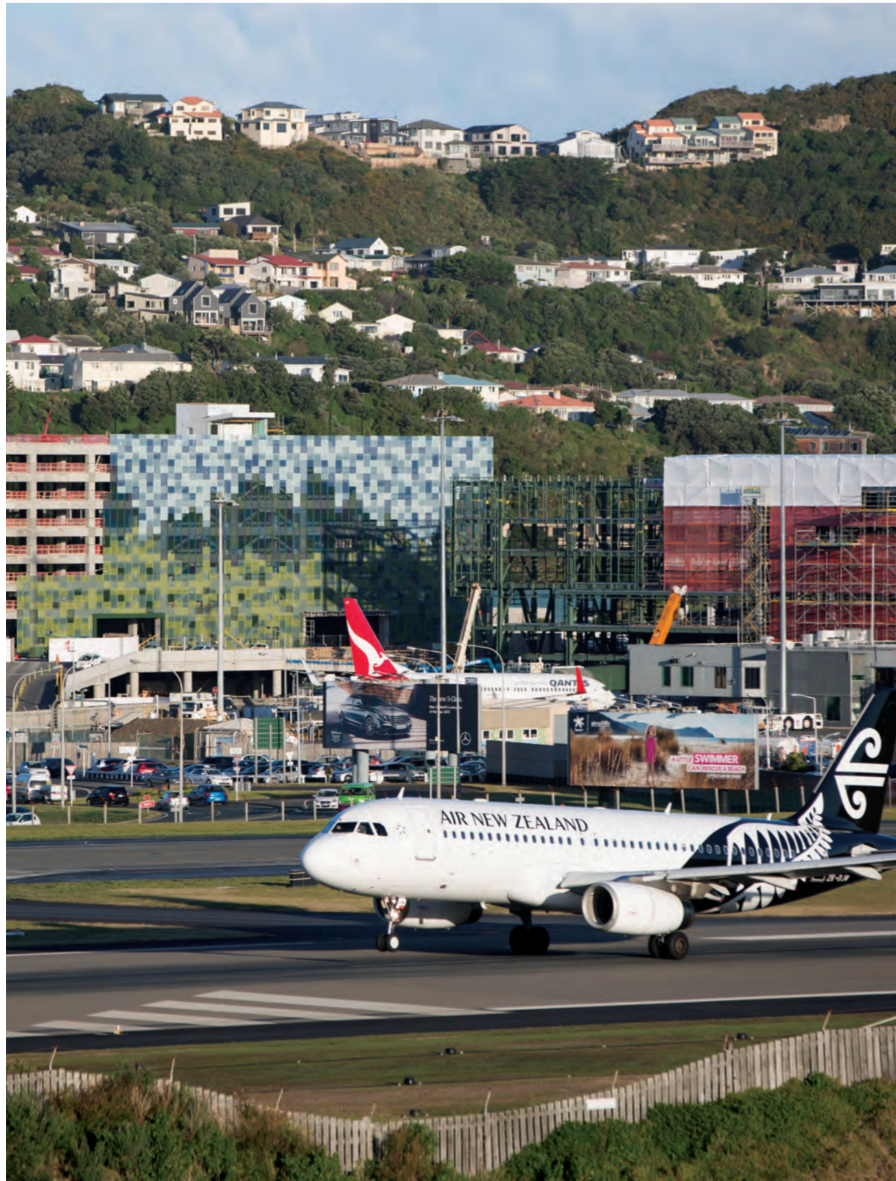
Airport Hotel & Transport Hub under construction